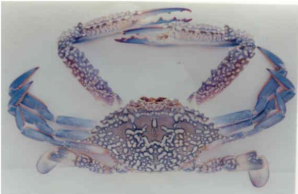
Figure 4: Portunus pelagicus Length, 180mm