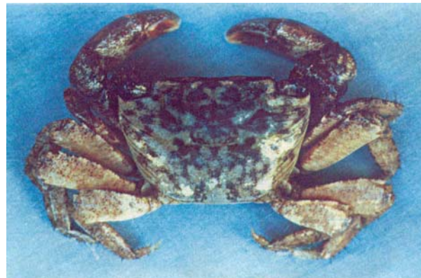
Figure 7: Metopograpsus messor Length, 170mm