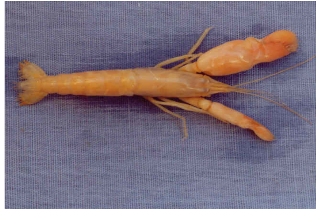
Figure 11: Alpheus lobidens Length, 45mm