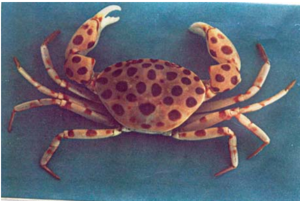
Figure 6: Carpilus convexus Length, 50mm