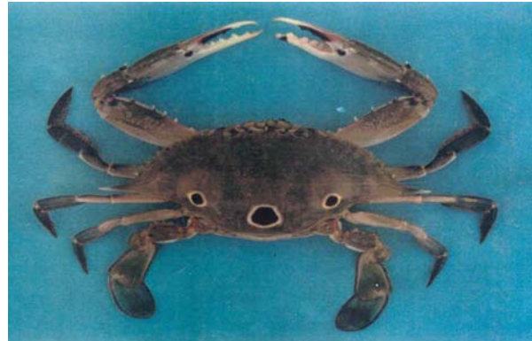
Figure 5: Portunus sanguinolentus Length, 170mm