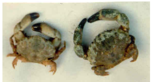
Figure 3: Pilumnopus vauquelini Length, 50mm