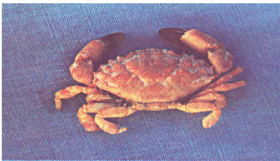
Figure 2: Leptodius exaratus Length, 30mm

In total, 12 species including 1 alpheid shrimp (Alpheidae) 2 Porcellanidae and 1 Diagonidae (Anomura), 2 Xanthidae, 2 Portunidae, 1 Grapsidae, 1 Pilumnidae, 1 Ocypodidae, 1 Carpiliidae (Brachyura) were found in this survey. It seems that most species show affinity to East Indian and west Pacific Ocean decapods. Only one of them, namely ( P. persica ), is endemic to the north part of the Persian Gulf and Oman Sea.