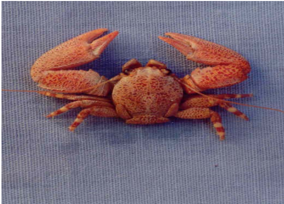
Figure 10: Petrolisthes rufescens Length, 22mm