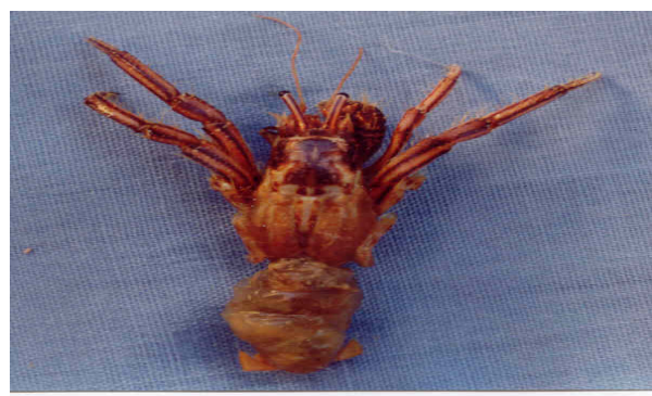
Figure 9: Clibanarius signatus Length, 6mm