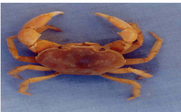
Figure 8: Eurycarcinus orientalis Length, 48mm