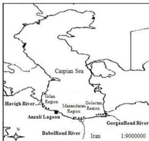
Figure 1: Map shows the sampling sites of Vimba vimba persa in the Iranian coastline

Iranian coastline of the Caspian Sea where this species migrates for spawning during spring (mid April to mid June), including 43 samples from Anzali Lagoon, 18 samples from Havigh River, 30 samples from BabolRoud River and 30 samples from GorganRoud River. The positions of these rivers are illustrated in Figure 1.