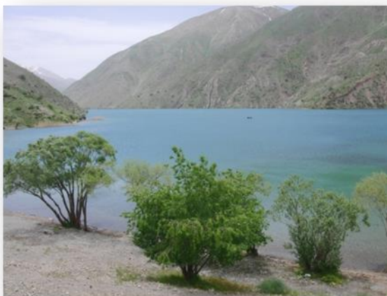
Figure 1: View of Gahar lake.

This research is the first report on Gahar Lake and Gahar River ichthyofauna and would contribute to the database required for conservation and sustainable utilization of Gahar Lake and Gahar River.