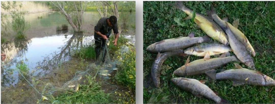
Figure 3: Catch of fishes by gill net.