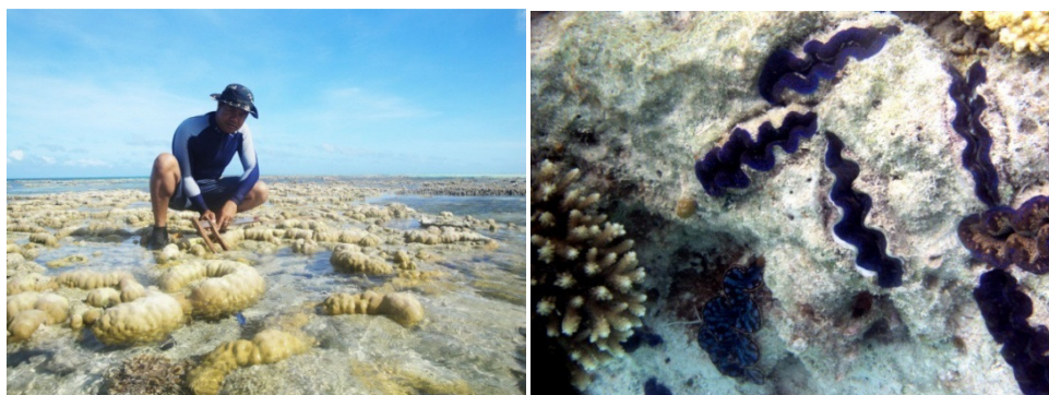
Figure 1. Measuring the shell lengths of T. crocea with the use of calipers (left) and a close-up view of several individuals embedded in exposed coral rock in Tubbataha Reefs Natural Park (right).

About 14% of samples were very small (10-29 mm) and such may indicate a self seeding reef.