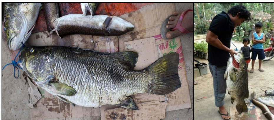
Figure 2. Lateral view of the Freshwater snapper (left) and a local biologist holding an individual which approximately measures 90 cm total length (right).

that about 1/3 of the world's freshwater fish species are under threat due to hydropower development (Nam et al. 2016). Furthermore, there have been unconfirmed reports of Freshwater snapper in the upper portions of the Iwahig River in central Puerto Princesa that should be further investigated to get more clarity on the distribution of the species within Palawan. To further understand its biology and ecology, as well as its economic potential for fisheries in the province, it is highly recommended to obtain specimen/s of the species for further scientific studies and purposes while further researches and assessments of the species in this newly recorded geographical range and in the whole province of Palawan are necessary. Lastly, this new record of the species together with several new other discoveries for the area should provide sufficient arguments to enthuse the local government to provide the whole Cleopatra's Needle Mountain Range with an official protective status.