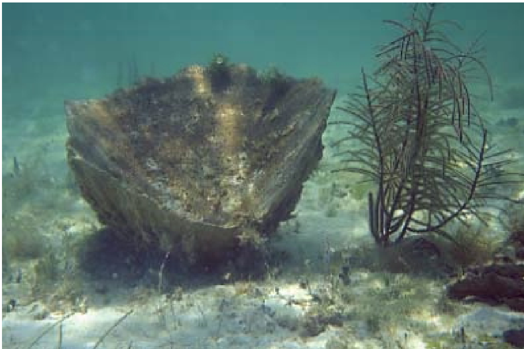
Sponge, Biscayne Bay (South Florida Water Management District)