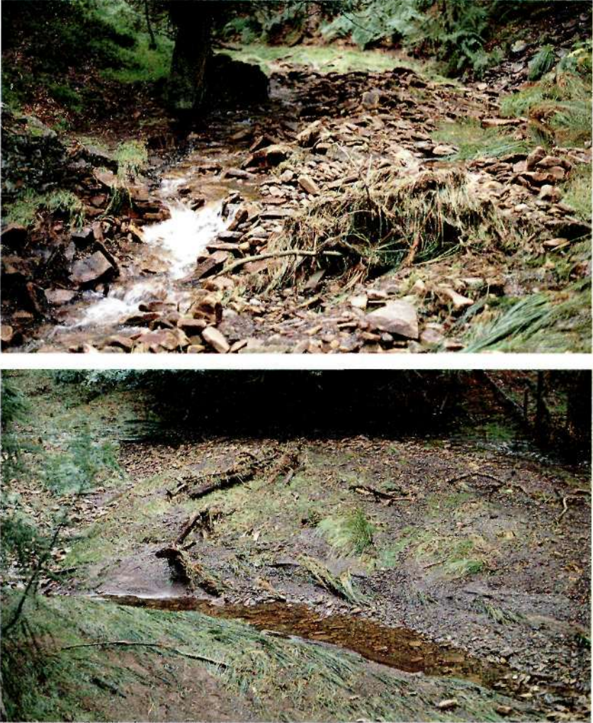
FIG. 3. Effects of the flood on Stake Clough (with dates on which the photographs were taken). Above : looking upstream from point A after the flood (8 August 1996); the stream channel has been displaced about 1 m to the left (as viewed in this photograph), removing a large chunk of the dry-stone wall which had stood there. The old channel is beneath the rubble in the centre of the photograph. Below : looking across the floodplain after the flood, showing point D (Fig. 1b; the former channel) in the foreground, and point B (the new channel) in the background (8 August 1996).