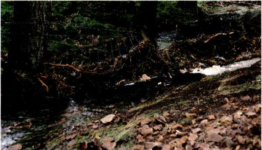
FIG. 4. Effects of the flood on Stake Clough (with dates on which the photographs were taken). Above : the former channel downstream of the fence, looking upstream (29 August 1996); the channel has been completely infilled with coarse gravel. Below : the new channel at point E (8 August 1996), showing aggregation of detritus on the fence.