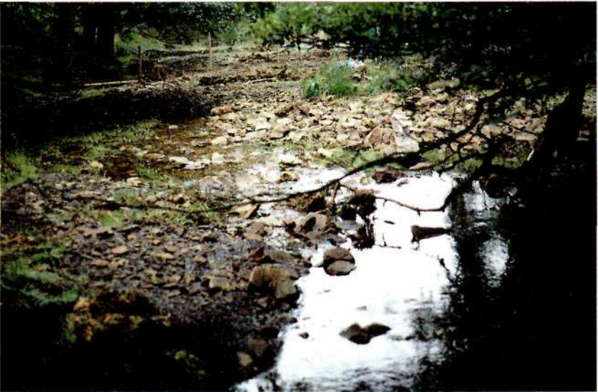
FIG. 2. Effects of the flood on Stake Clough (with dates on which the photographs were taken). Above : looking downstream from point A (Fig. 1b), before the flood (21 March 1995). Below : looking downstream from point A, after the flood (29 August 1996).