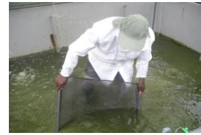
Plate 3: Hiding shelters for molted shrimp.