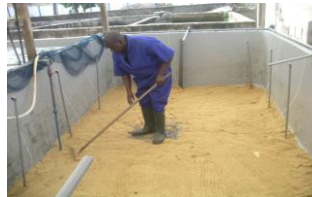
Plate 2: Laying of sharp sand and granite