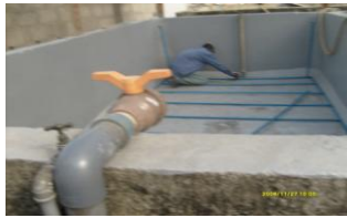
Plate 1: Preparation of grow-out tank and laying of PVC perforated pipes