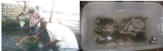
Plate 5: Harvesting of table-size P. monodon after 157 days culture trial