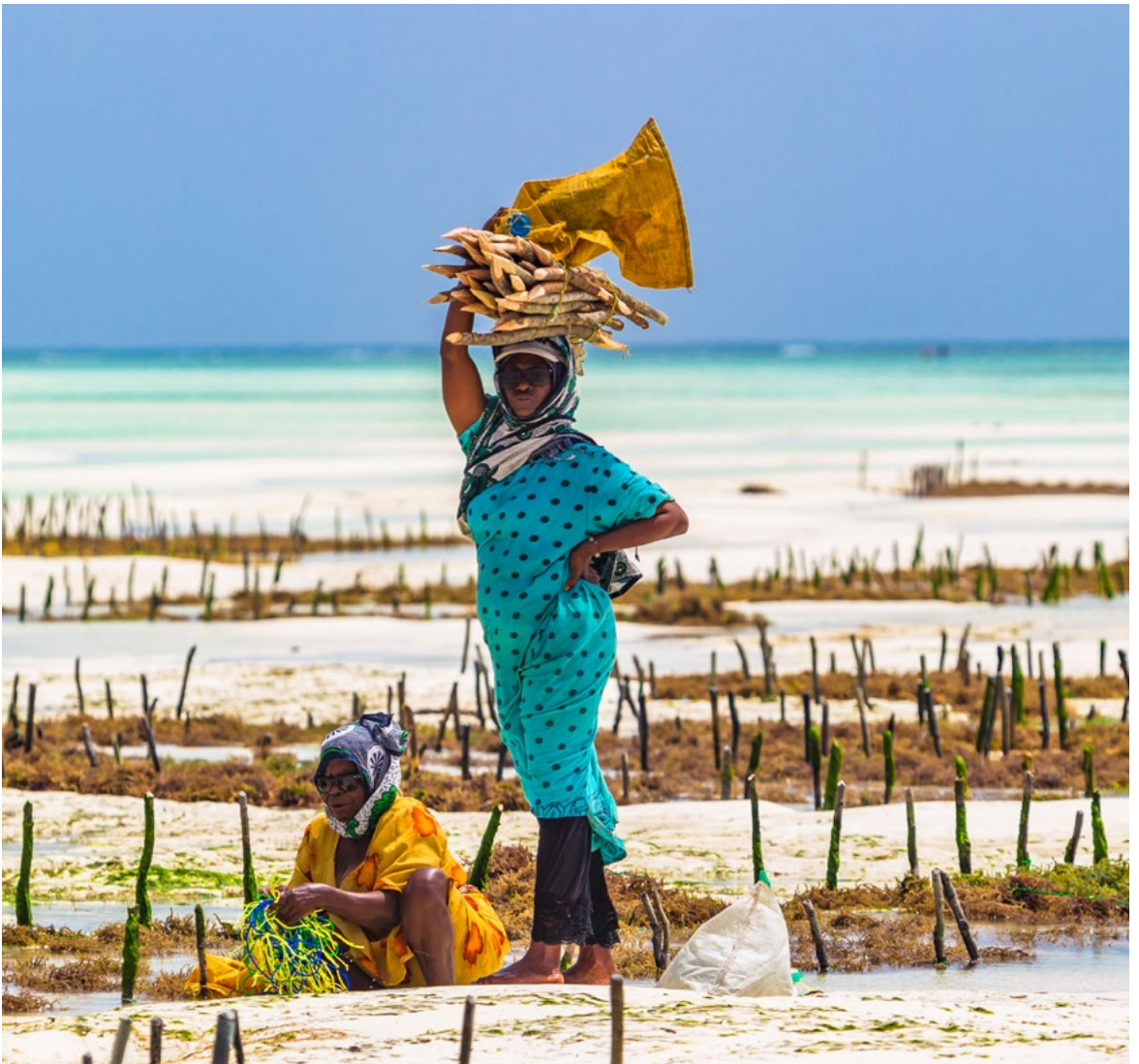
Jambiani, Zanzibar, Tanzania