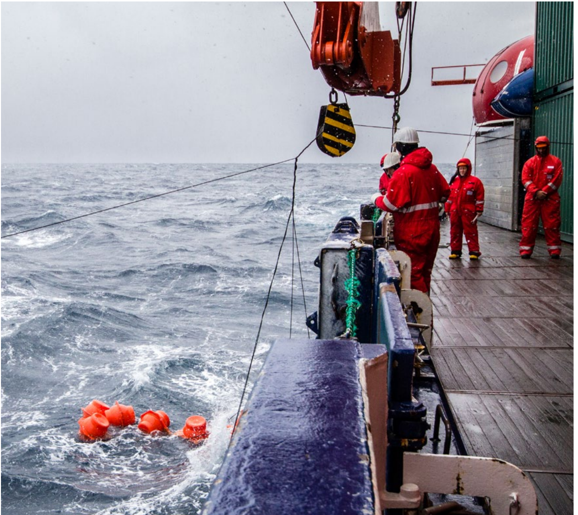
Weddell Sea, Antarctica

IIOC Regional Subsidiary Bodies are the most efficient platforms for co-designing and co-delivering IOC capacity development activities with Member States, leaving no one behind.