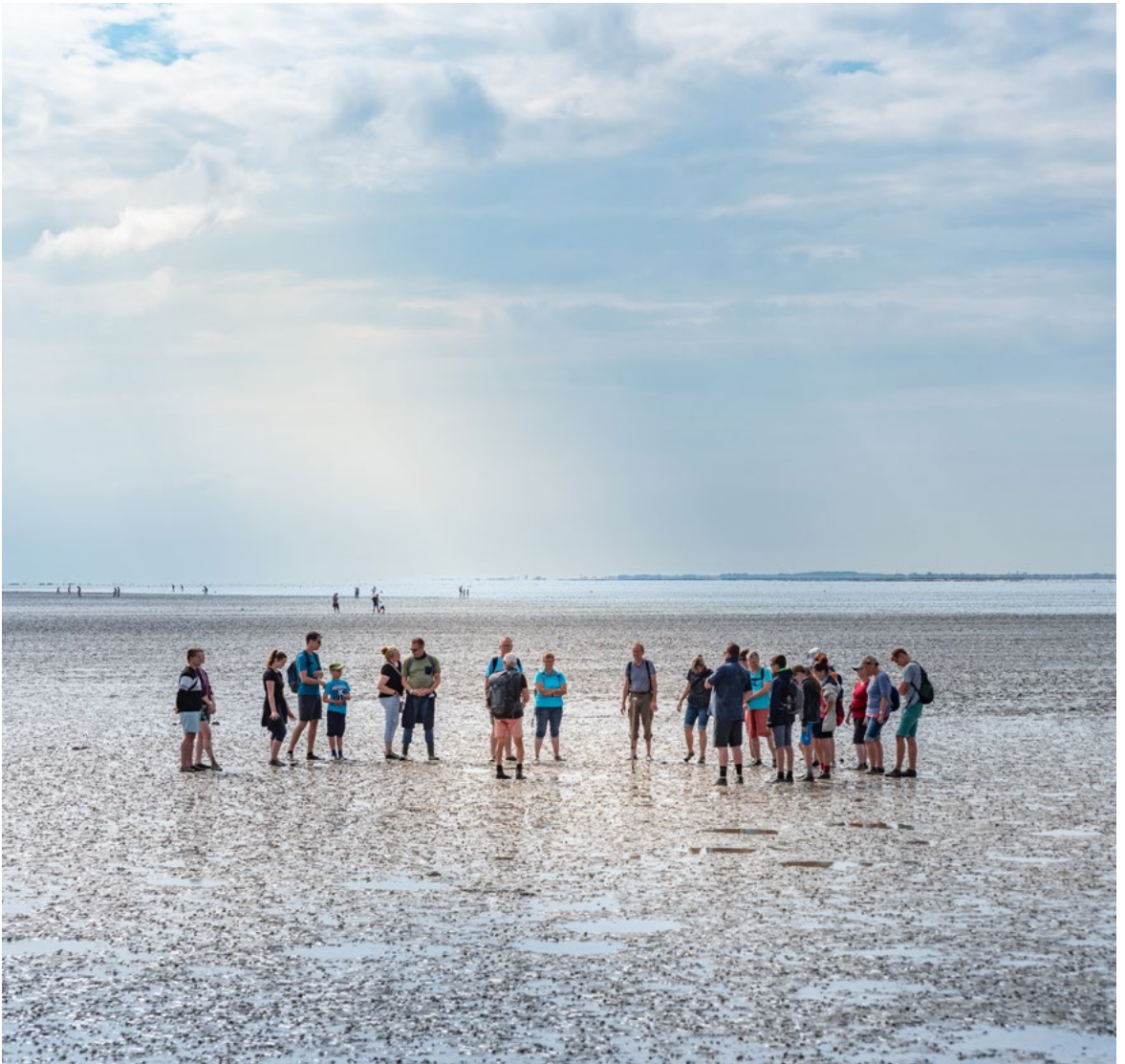
Bensersiel, Germany