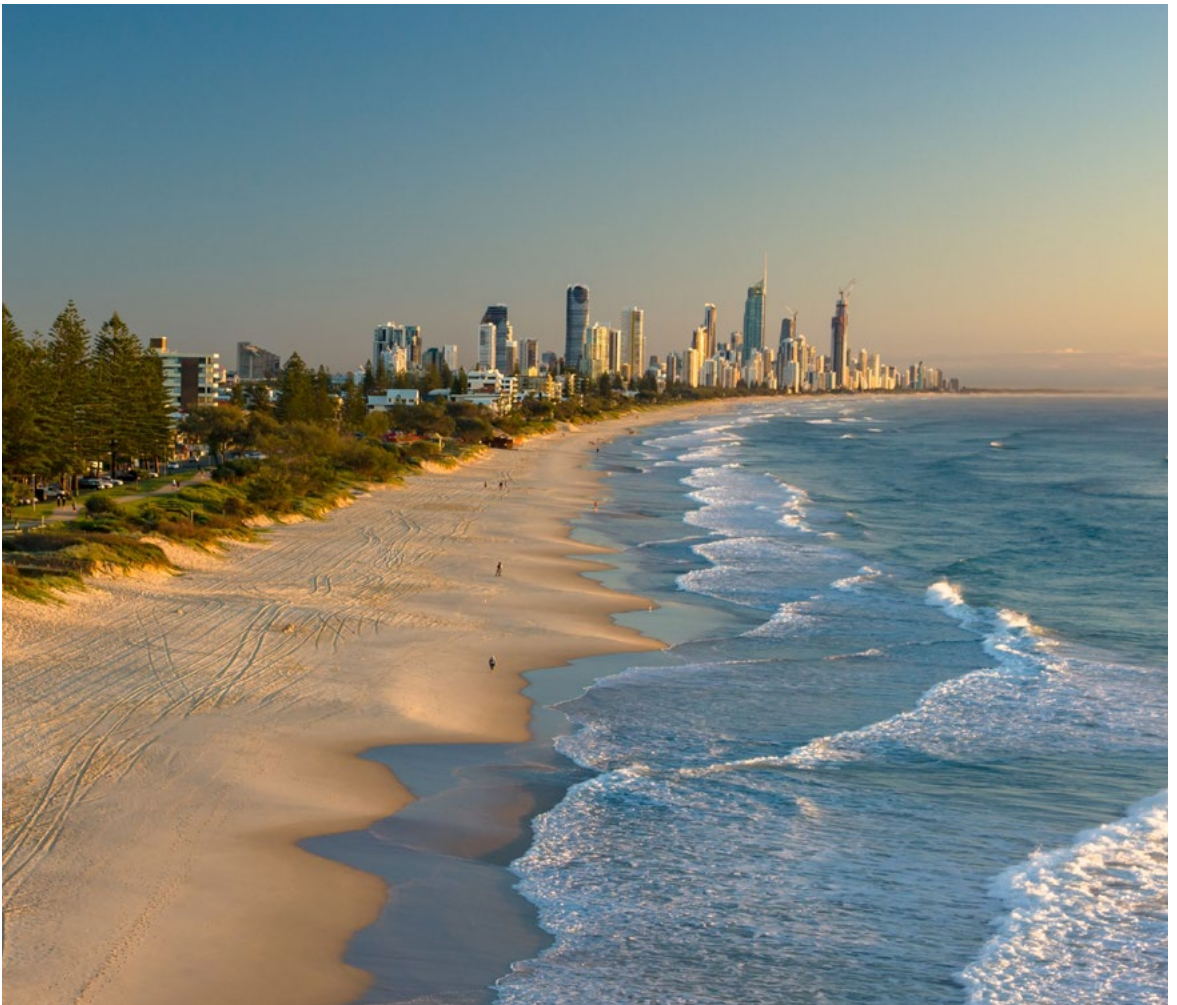
Gold Coast City, Queensland, Australia

The role of IOC will only continue to increase in the future, because maintaining vital life-support functions of the ocean is becoming more and more science-intensive.