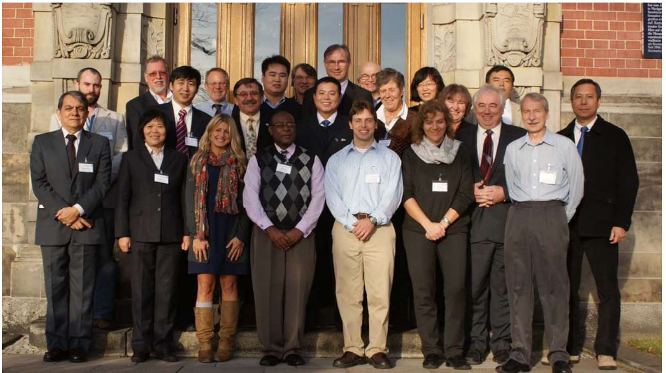
MCDS1 GROUP PHOTO