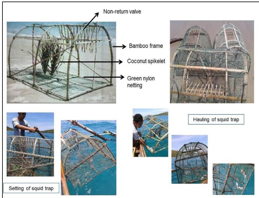
Figure 2. The squid traps used in the study.