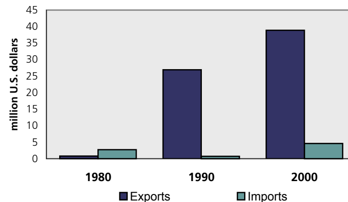
Trade in Fish and Fisheries Products, Kenya, 1980-2000

View more Country Profiles on-line at http://earthtrends.wri.org