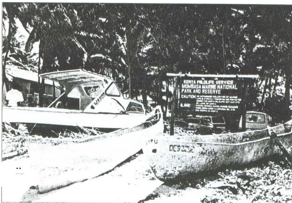
A warning notice from Mombasa Marine National Park cautioning against collection of all marine life.

Annual landings of spiny lobsters, the single most valued coral reef fishery, have been stable at about 70 t in Kenya, and are dominated by Panulirus ornatus accounting for 90% of the catch by weight. The landings come from artisanal fishers, diving to about 10m depth and using spearguns, handnets or octopus handnets. The most important lobster fishing grounds are