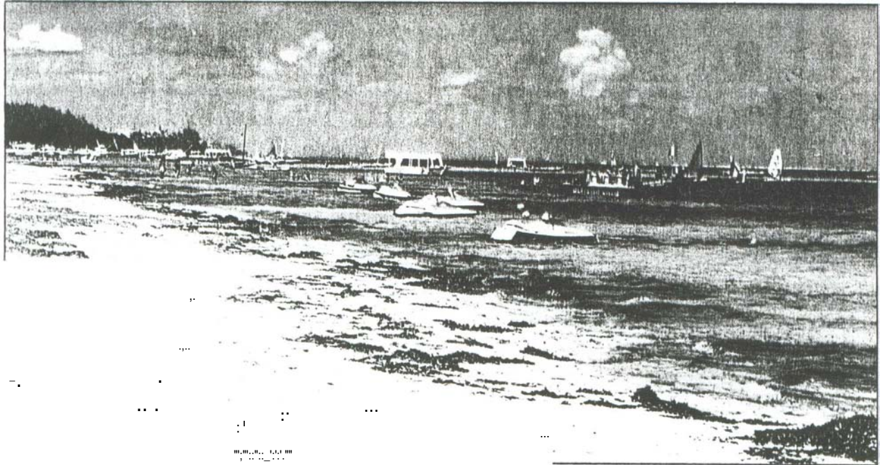
Heavy boating and diving activities are a major threat in most protected reefs.

reefs in Malindi and fisheries seem to be improving. However, the long-term solution is to deal with the problem at the source by reducing soil erosion. Use of suction dredges and geotextile silt curtains during local dredging operations would reduce the damage on nearby coral reefs.