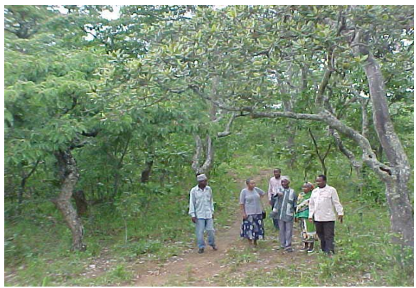
Photo Caption: The Mbozi Mission village expanded conservation of natural forests for the protection of springs as part of their implementation of plans derived from the TanzaKesho PRA exercise.

School buildings renovated, springs protected, forests put under protection, drug use reduced, improved family welfare, enhanced gender equality; increased self-reliance and organization to plan and implement local projects; District Council decided to expand the program to two more divisions, using district funds.